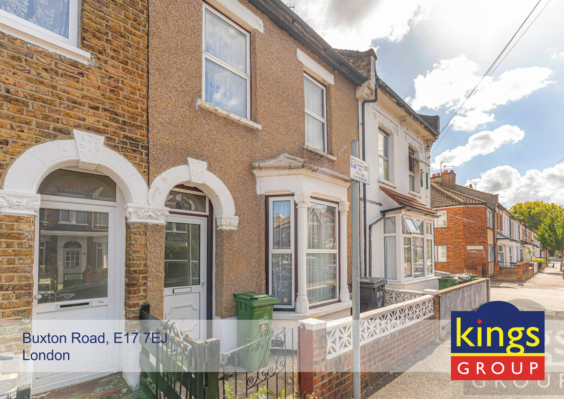
Buxton Road, E17 7EJ London